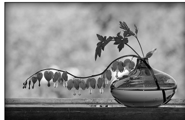
"Loved with a love beyond telling, Missed with a grief beyond all tears."

Proceeds from this event will be donated to the Moravian College through the Sally Breidegam Miksiewicz Scholarship Fund.