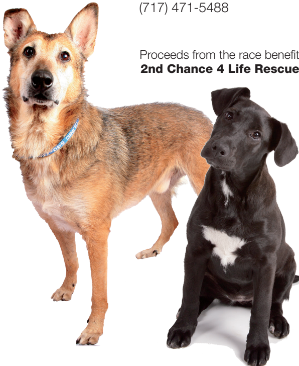
Proceeds from the race benefit 2nd Chance 4 Life Rescue